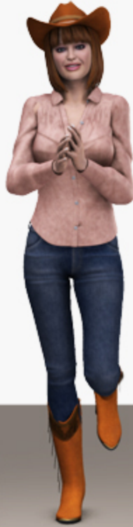
Bring your left foot up to your right knee, clapping your hands