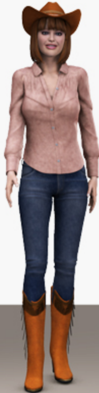
Step back on your left foot