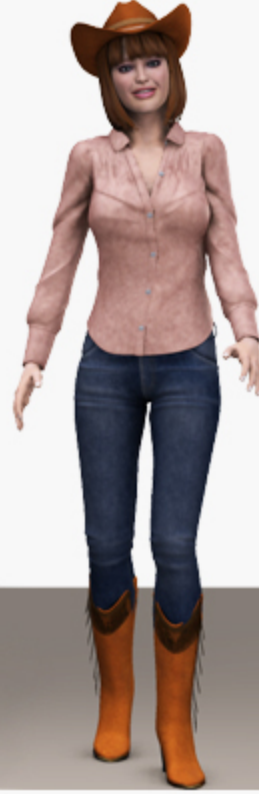
Step forward onto your left foot