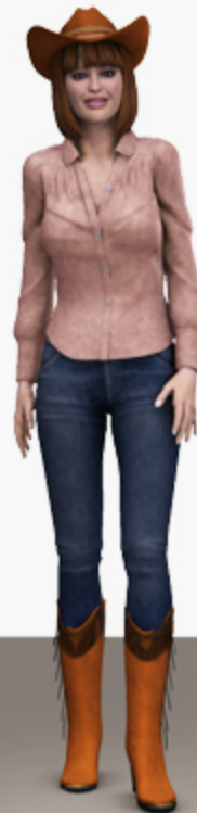
Step back on your right foot