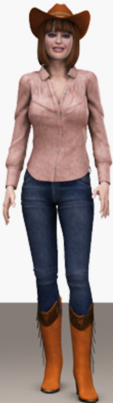
Step back on your right foot