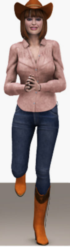
Bring your right foot up to your left knee, clapping your hands