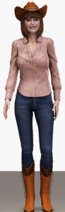
Touch your left foot down, but don't put your weight on it