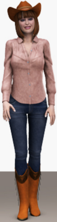
Step forward onto your right foot